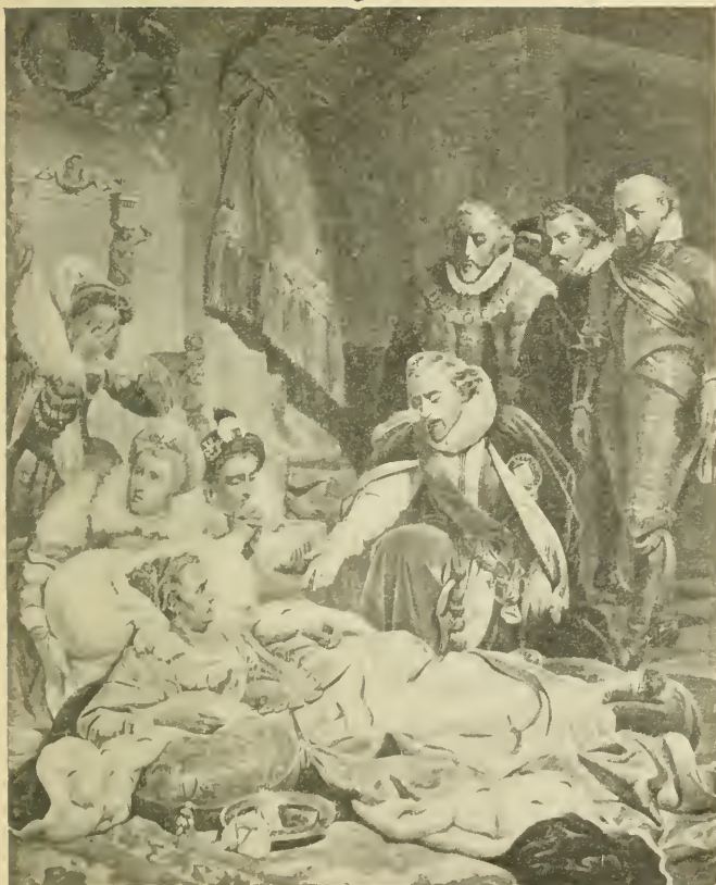
LAST MOMENTS OF ELIZABETH.